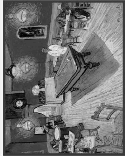
Size: 28 1/2 x 36 1/4 in (72.4 x 92.1 cm)

■ I am seeking, I am striving. I am in it with all my heart.