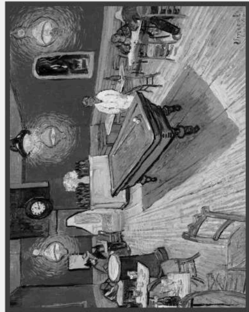
Size: 28 1/2 x 36 1/4 in (72.4 x 92.1 cm)

■ I am seeking, I am striving. I am in it with all my heart.